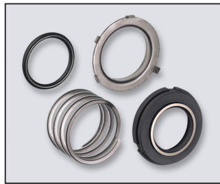
KIT 3: O-Ring, Cup, Spring, Carbon