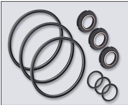
KIT 2: Casing Gaskets, Carbons, O-Rings