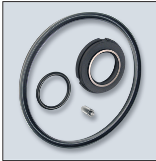
KIT 1: O-Ring, Carbon, Impeller Pin, Casing Gasket