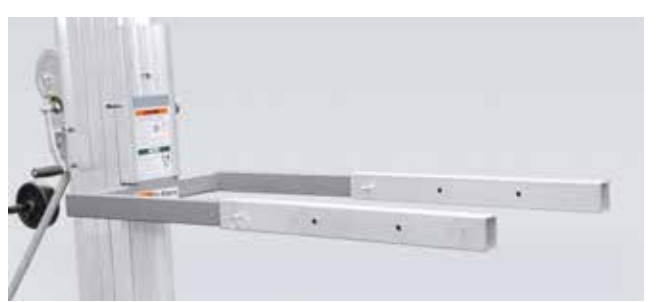
FORK EXTENSIONS insert onto standard forks for an additional 64 cm (25 in) of length.