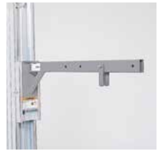
BOOM OPTION transforms your lift into a mobile, vertical crane or hoist to position tooling fixtures, circuit breakers, engines and more.