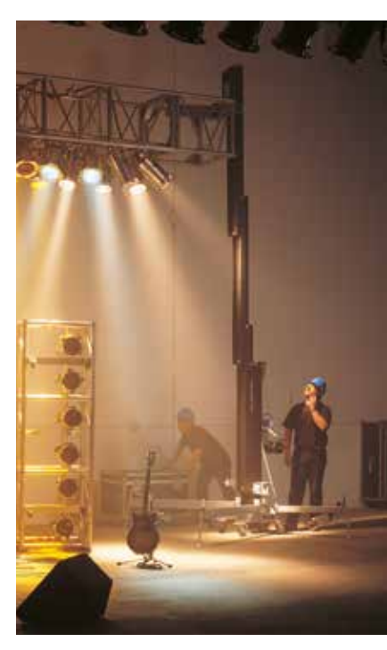
Quick, Simple Setup

The compact stowed position makes the Super Tower lift easy to move through doors and load on trucks with no bulky base to get in the way. Stowed dimensions are 56 cm (22 in) by 64 cm (25.25 in).