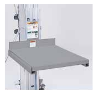
LOAD PLATFORM fits over the forks to handle odd-sized or heavy objects — no tools required for installation.