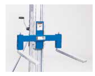
FLAT FORKS, which widen from 41 to 79 cm (16 to 31 in) to provide proper support, allow you to easily lift your load off of flat surfaces.