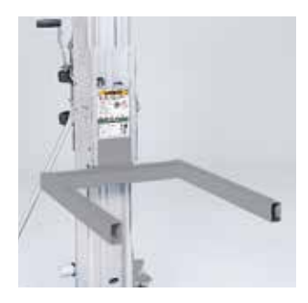
STANDARD FORKS accommodate various loads for versatile lifting. Get an additional 51 cm (20 in) of lift by turning over and re-pinning the forks.

A variety of load handling accessories make this unit extremely versatile.