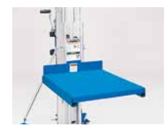
LOAD PLATFORM fits over the forks to handle odd-sized or heavy objects - no tools required for installation.