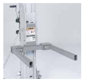
ADJUSTABLE FORKS widen from 28 to 76 cm (11 to 30 in) to accommodate diverse loads.