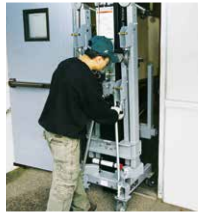
Easy Transport and Storage

Fork extensions insert onto standard forks for an additional 25 in (64 cm) of length.