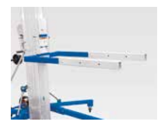
FORK EXTENSIONS insert onto standard forks for an additional 64 cm (25 in) of length.