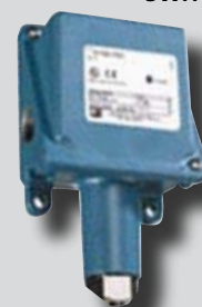
DISCHARGE PRESSURE SWITCH