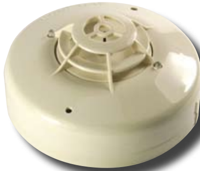
Heat detector 130-310