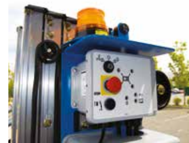
Operational Warning Light