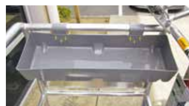
Work Station Tray