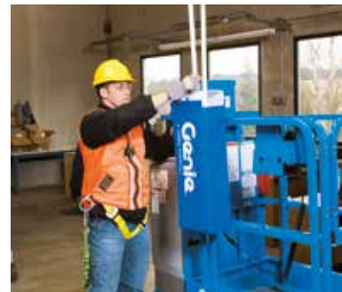
Fluorescent Tube Caddy