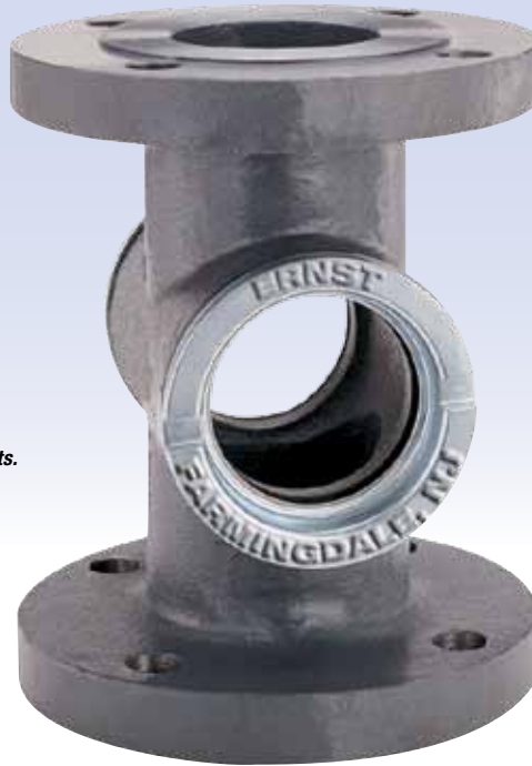
MODEL EFI 215-P (Plain)