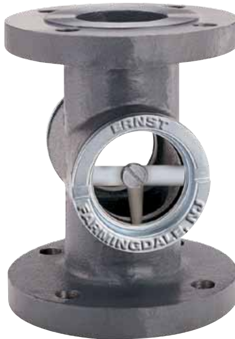
MODEL EFI 215-F (Rynite® Flapper) Not recommended for downward flow