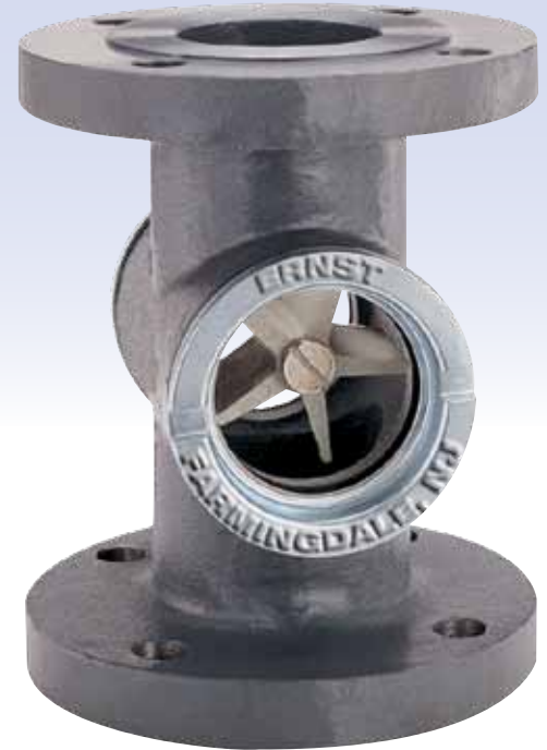
MODEL EFI 215-R (Rynite® Rotating Wheel)

MODEL EFI 215-P (Ball Action) not shown... specify ball material