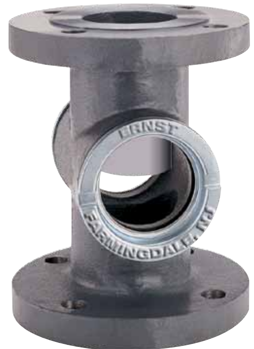
MODEL EFI 215-D (Drip Tube)