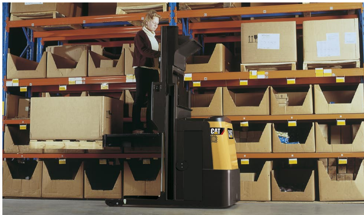
(Pictured clockwise from far left) The NOH10N is designed for high-level picking up to heights of 11.5 meters.

The rising load and platform of the NOL10N reduces operator fatigue when order picking at floor, first and second levels.