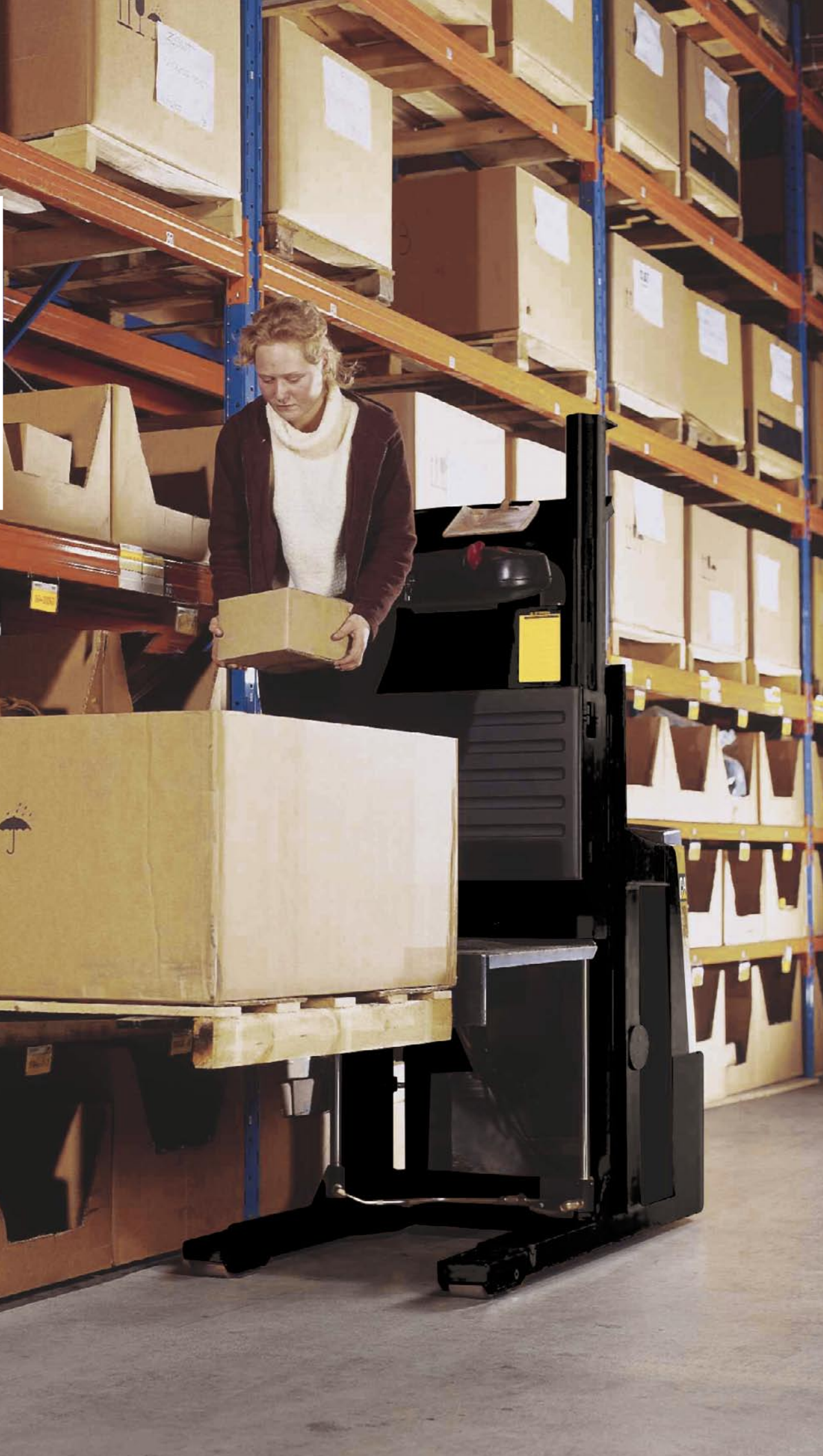
(Main picture) The rising platform of the NOL10N makes second level picking safe and easy.