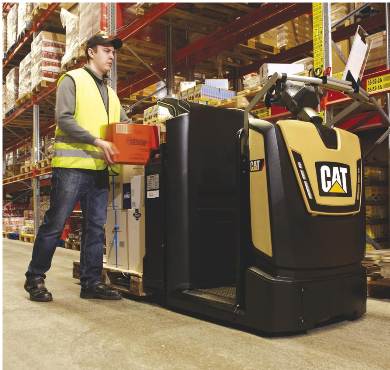
(Main Picture) Low level picking: An operator loads the NO20NE .

The rising load and platform of the NOL10N reduces operator fatigue when order picking at floor, first and second levels.