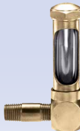
MODEL EFI 526