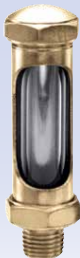
MODEL EFI 530