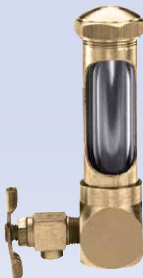
MODEL EFI 524