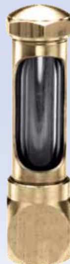
MODEL EFI 522