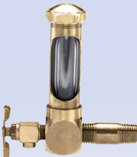
MODEL EFI 527