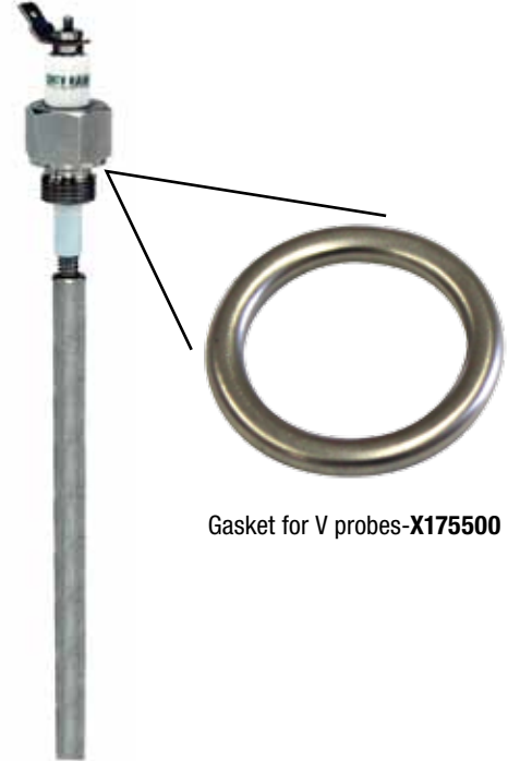
Gasket for V probes- X175500

with 2 Gaskets For Steel Water Columns (up to 1000 PSI)- RV360RK