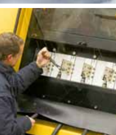
Re-positionable control panel