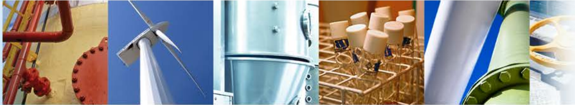
The CSC201, mAcal, and 24VDCPS.