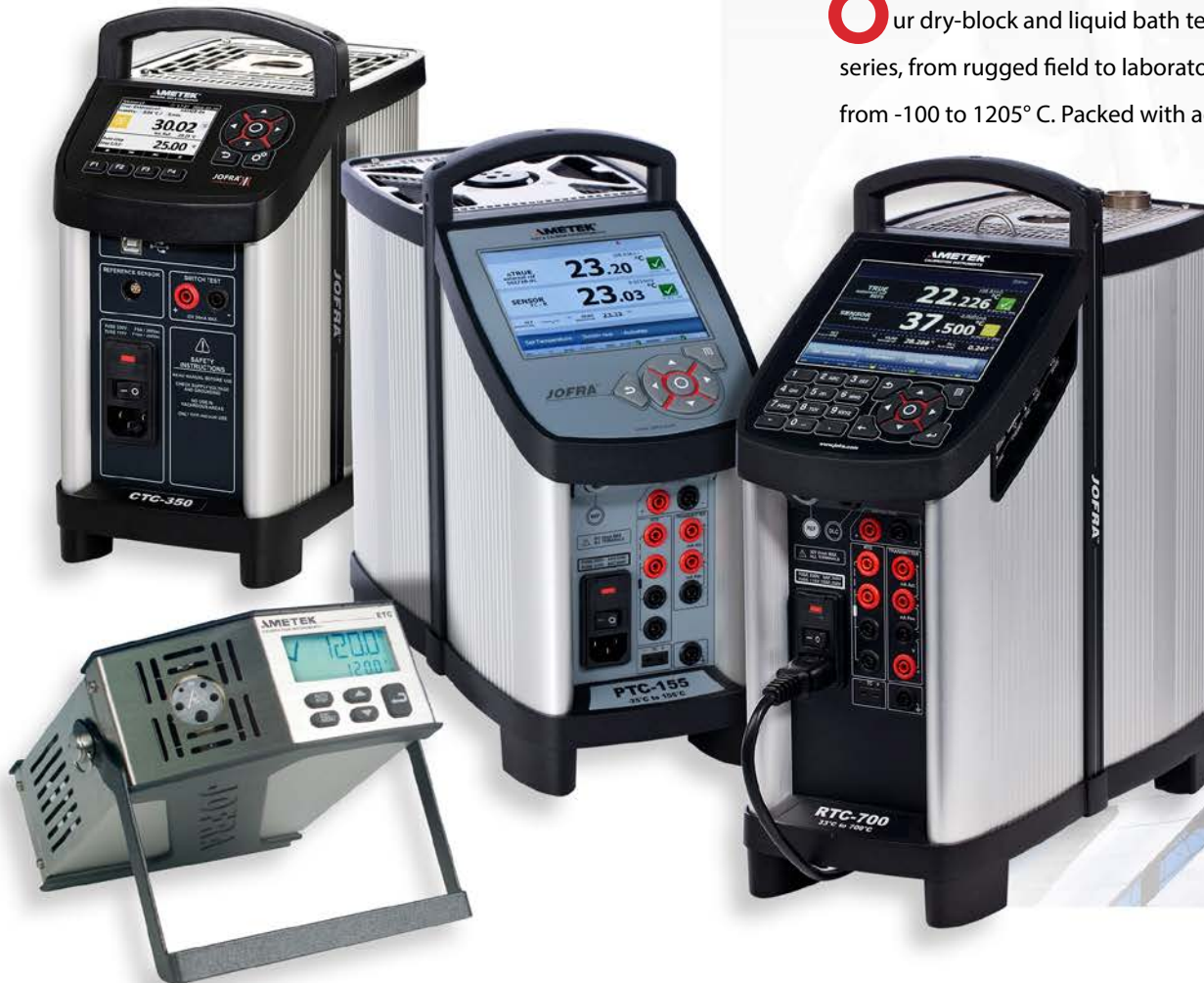
Shown from left to right: The ETC, CTC, PTC, and RTC.