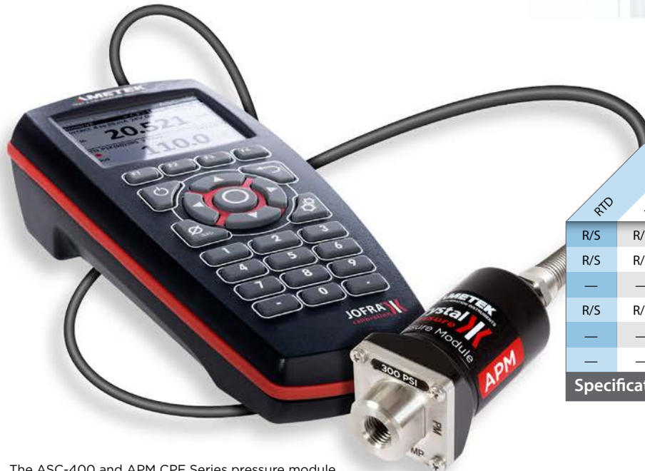
The ASC-400 and APM CPF Series pressure module.

If you don't need the advanced features found in our multifunction calibrator, our single task instruments, including the mAcal, CSC Series, and 24VDCPS, make calibrating instruments like pressure transmitters fast and easy.