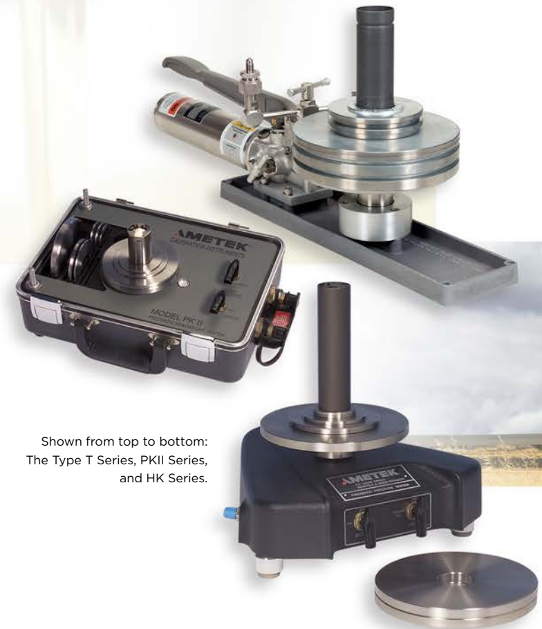
Shown from top to bottom: The Type T Series, PKII Series, and HK Series.