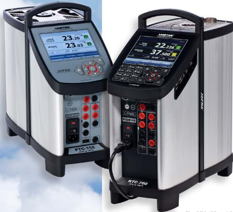
The PTC-155 and RTC-700.

A diverse product line, unique features, and world class support for a wide range of calibration solutions.