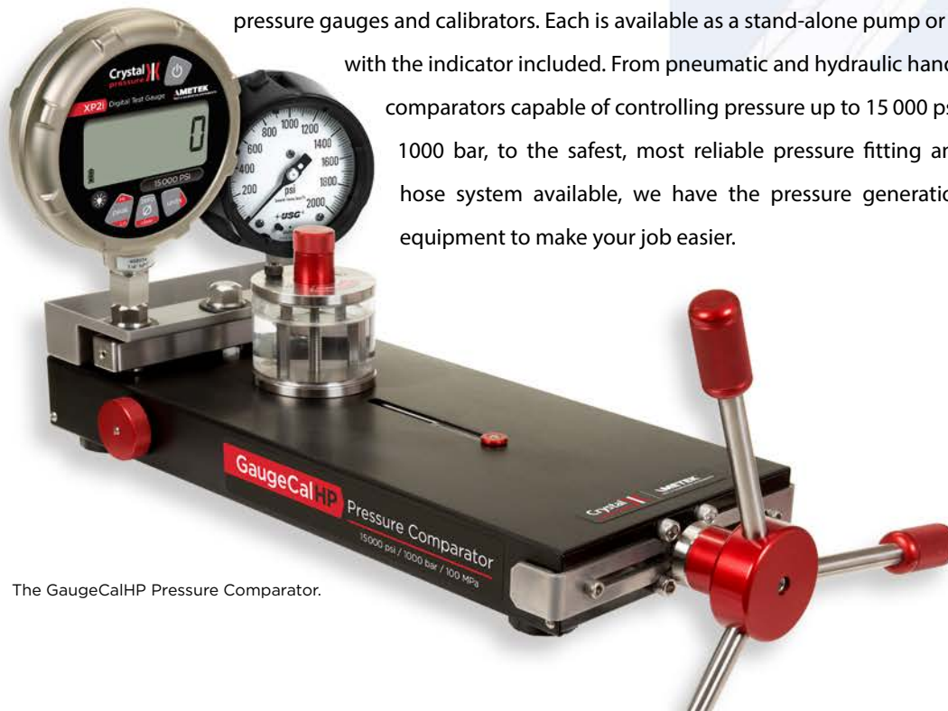
The GaugeCalHP Pressure Comparator.

O ur pressure hand pumps, comparators, and fittings & hoses are the perfect complement to our popular pressure gauges and calibrators. Each is available as a stand-alone pump or part of a complete system with the indicator included. From pneumatic and hydraulic hand pumps, to pressure comparators capable of controlling pressure up to 15 000 psi / 1000 bar, to the safest, most reliable pressure fitting and hose system available, we have the pressure generation equipment to make your job easier.