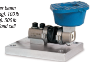
RL50210 TA mild steel (50 lb-250 lb)

Module with RL50210 or RL50210SS cantilever beam load cell; capacities (per module): 50 lb (22.7 kg), 100 lb (45.4 kg), 150 lb (68.0 kg) and 250 lb (113.4 kg). 500 lb model features RL30000 single-ended beam load cell