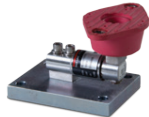
RL50210 TA-SS, stainless steel (50 lb-250 lb)