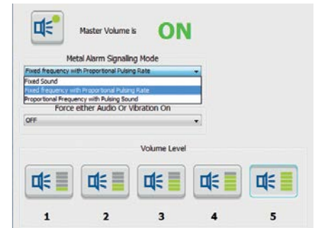
✓ Audio Signaling Setting