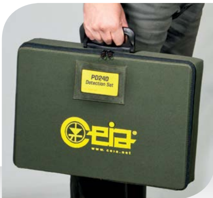
☑ PD240 Hand Held Detection Set with carry bag