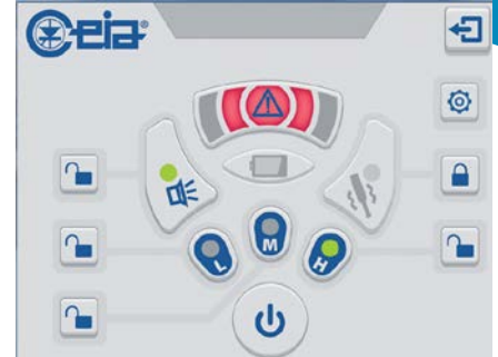
✓ Main Menu