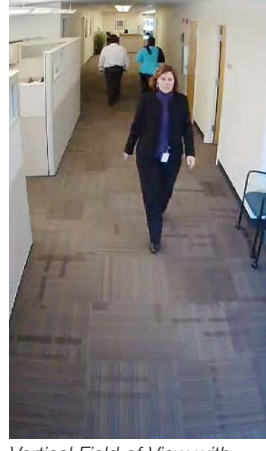
Vertical Field of View with Corridor Mode

Environmental . . . . . . . . . . . . RoHS, WEEE