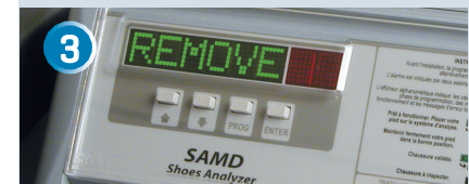
3 THE REMOVE MESSAGE INFORMS THE PASSENGER OF THE COMPLETION OF THE ANALYSIS