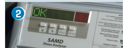
2 THE OK MESSAGE MEANS THE SHOE HAS BEEN INSPECTED WITH NO DETECTION OF A METAL THREAT