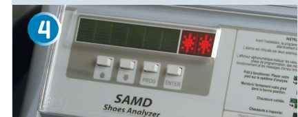
4 IN CASE OF DETECTION, SAMD GENERATES AN ACOUSTICAL AND A VISUAL RED ALARM