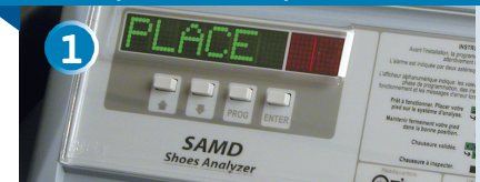
1 SAMD CONTROL UNIT SHOWS THE PLACE FOOT MESSAGE