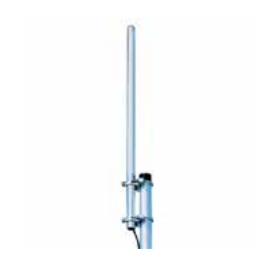
Omni outdoor antenna