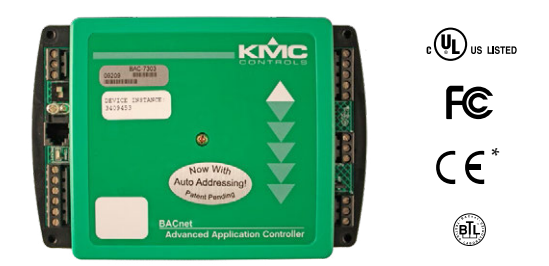
SEE ALSO: Controller Selection Guide on page 6 and BAC-730x/740x series web page for details.

These native BACnet, fully programmable, direct digital controllers designed for small air handling units (AHU), roof top units (RTU), fan coil unit (FCU), or heat pump units (HPU). They come supplied with installed programming sequences for their respective type of application. Use these versatile controllers in stand-alone environments or networked to other BACnet devices. As part of a complete building automation system, they provide precise monitoring and control of connected points. They install and configure easily, are intuitive to program, and contain modular jacks for quick connections to NetSensors. The BAC-7xxxC models include a real-time clock with power backup for 72 hours.