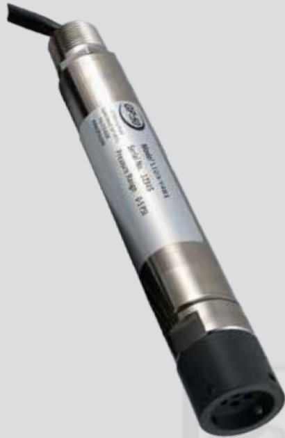
Model BR1103-Y481 Submersible Level Transmitter with Sludge Screen