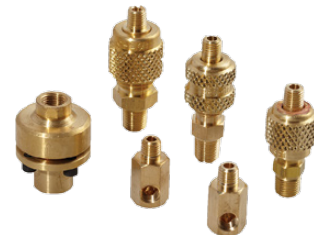
VPASU ANTI-SIPHON VALVE KIT 1/4" SAE, 3/8" SAE, 1/2"-20 UNF female knurl nut