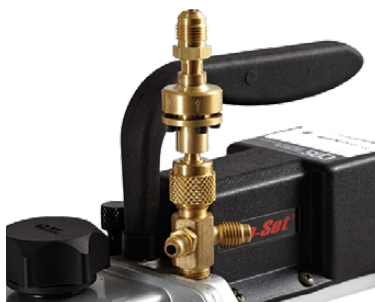
VPAS4 ANTI-SIPHON VALVE KIT 1/4" SAE female knurl nut