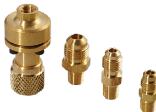
VPAS8 ANTI-SIPHON VALVE KIT 3/8" SAE female knurl nut