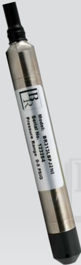
Model BR313L-NI Titanium Submersible Level Transmitter