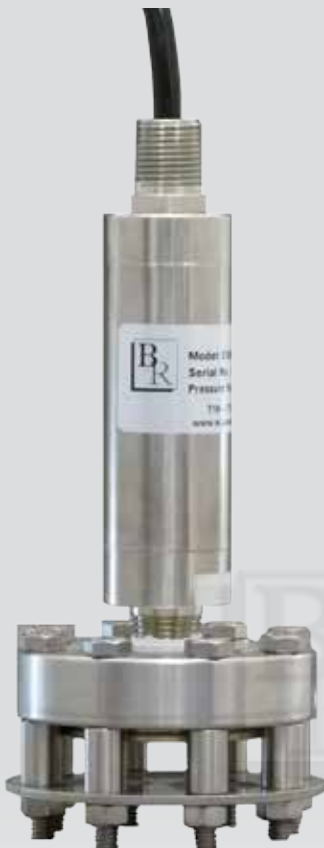
Model BC001 Birdcage®