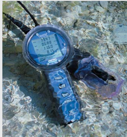
The Quanta Field Display – waterproof (IP 67/NEMA 6), robust, compact, easy to use, simple menu-driven operation

The Quanta Measuring System has been developed for the cost effective and accurate monitoring of water quality