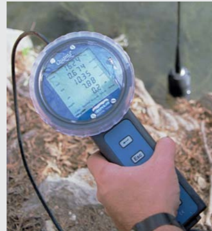
The Quanta Field Display – displays readings of up to 5 parameters simultaneously

transmission etc.) as well as the potential for alarm functionality to alert users to possible quality events.