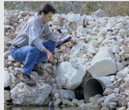
Portable online-measurement of water quality at a waste-water outlet