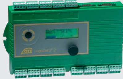
Station-Manager OTT LogoSens 2