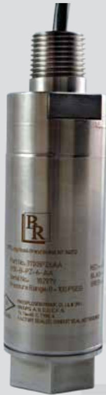
Models 111X/P, 211X/P, 311X/P & 311N/AN/GN Explosion Proof & Zone 2/Div 2 Pressure Transmitter