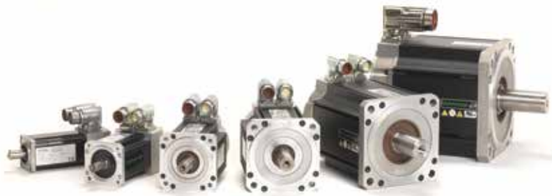
The Unimotor hd family ranges from 55 mm to 190 mm

Unimotor hd has a high power to weight ratio, meaning that it can be easily integrated into the smallest, most demanding applications such as industrial robotics, pick & place and packaging.