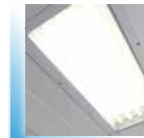
Industry-leading light levels