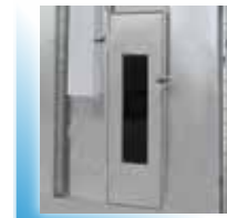
Windowed personnel access doors