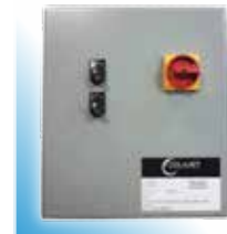
UL & ETL listed control panel