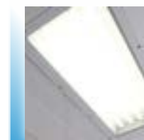
Industry-leading light levels