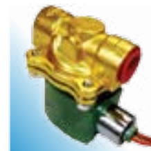
Air solenoid valve