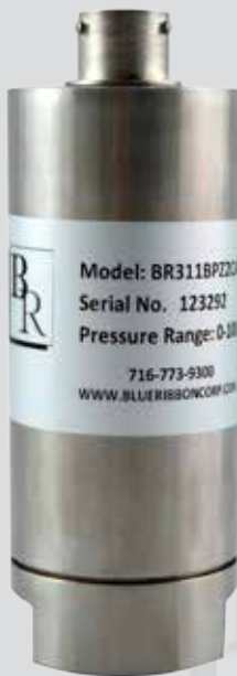
Model BR111 / BR211 / BR311 Industrial Grade Pressure Transducer