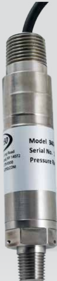
Model BR240/340 AI/AN Hazardous Location Pressure Transmitter