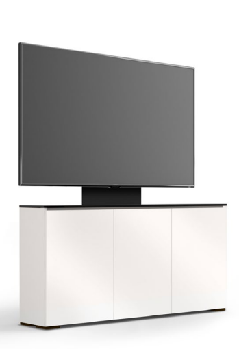
Low Profile 337 With TV Mount 64.75"W x 31.375"H x 12"D Holds 50-70" TV's, 175 lbs (80kg)