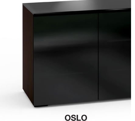
Wenge Sides, Black Doors Solid Surface Black Top