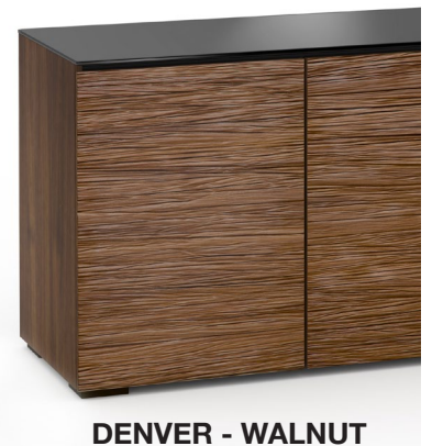
Medium Walnut, Bark-Textured Doors with Solid Surface Black Top