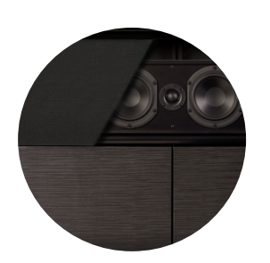
Ask about our integrated Premium Soundbars

Model 345 features a center opening with a removable, grill designed to hide a speaker.