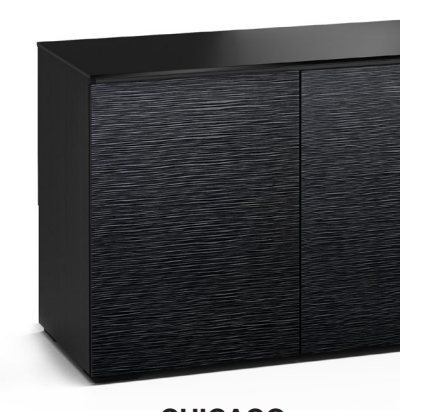
CHICAGO Black Oak, Grass-Textured Doors with Solid Surface Black Top