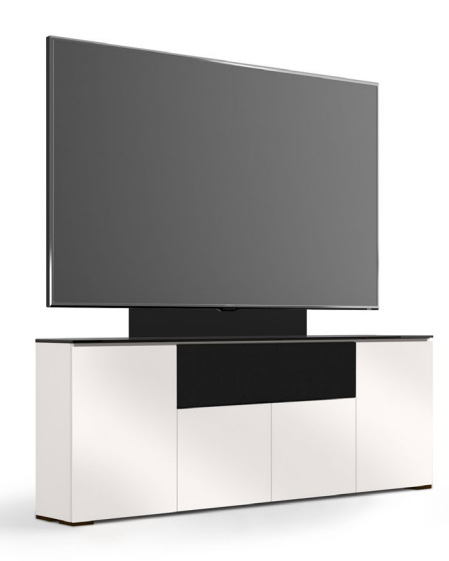
Low Profile 345 with TV Mount 85.5"W x 31.375"H x 12"D Holds 50-103" TV's, 175 lbs (80kg) Speaker Compartment: 40"W x 11"D x 9"H