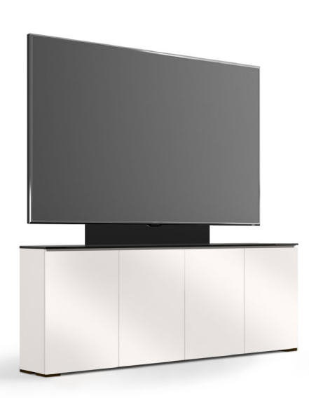
Low Profile 347 With TV Mount 85.5"W x 31.375"H x 12"D Holds 50-103" TV's, 175 lbs (80kg)