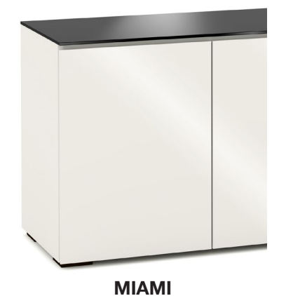
Gloss Warm White Door, with Solid Surface Black Top