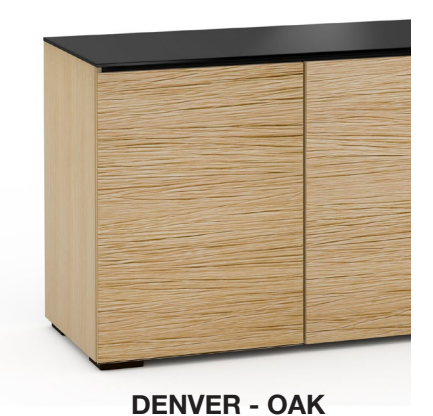
Natural Oak, Bark-Textured Doors with Solid Surface Black Top