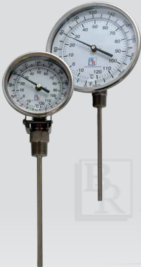
Model BR3A and BR5A Bi-Metal Thermometer Adjustable Angle Type