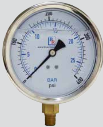
Model BR201L Shown