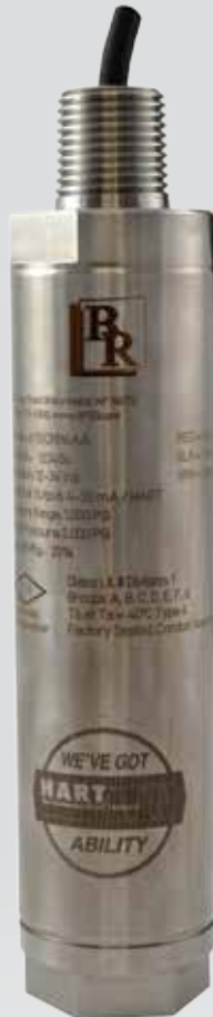
Model BR411, 411XP Smart Rangeable Pressure Transmitter