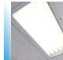
Industry-leading light levels