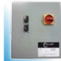
UL & ETL listed control panel