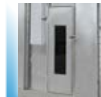
Windowed personnel access doors