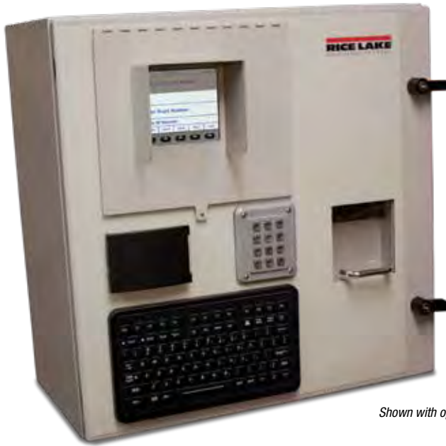
Shown with optional features