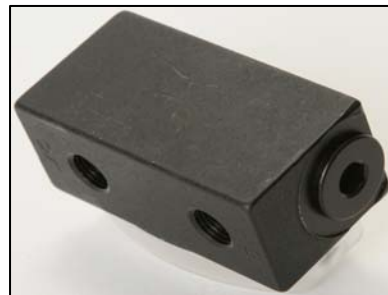
Model 126/127 Bottom Connections Shown

* Viton ® is a Registered Trademark of DuPont Dow Elastomers