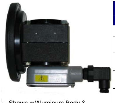
Shown w/Aluminum Body & (1) Reed Switch with Condulet enclosure and Plug-In Connector (Din 46350-PG 11)

CSA listed control switching is available in an explosion-proof enclosure which complies with NEC Class I, Groups C and D; Class II Groups E, F, and G; NEMA 7 and 9 standards. These are machined cast-aluminum enclosures with 1/2" FNPT conduit connection and 24" wire leads.