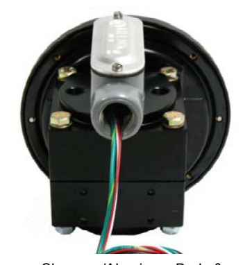
Shown w/Aluminum Body & (1) Reed Switch in Condulet enclosure

Model 130 is available in Aluminum, Brass and 316SS bodies only with one or two hermetically sealed reed switches for low and/or high limit alarm. These CSA listed switches are Single Pole Double Throw (SPDT) with adjustable set points. Switches can be set to activate/deactivate on rising or falling pressure. Switches are enclosed in a weather resistant housing. Switch setting is readily made with a screw adjustment.