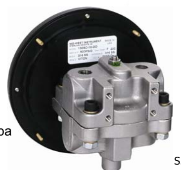
Shown with S.S. Cast Body