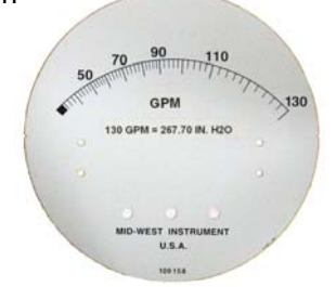
0-130 GPM Flow Gauge Scale

The low range capability of the Model 130 is ideally suited for flow, liquid level and vacuum applications. Magnetic coupling between the sensing element and the indicating pointer provides for complete isolation of the process fluid within the pressure capsule. The few internal metal parts are 316L Stainless Steel.