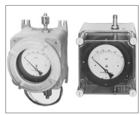
Model 130 in Explosion Proof (left) and NEMA 4X (right) enclosures