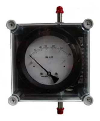
Shown in NEMA 4X Plastic enclosures

Factory preset switch at no extra charge (Specify Setting) Specify increasing or decreasing range to be set.