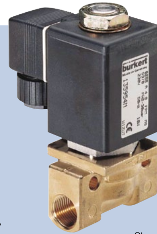
Shown with 2508 plug

High performance plunger operated, direct-acting solenoid valve with integrated metallic body seal and wear resistant stainless steel seat. Three way (Type 0355), high pressure (1470 PSI), and high temperature (482 °F) versions are also available.