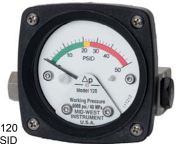
Model 120 0-50 PSID With Special 3 Color Dial

An optional maximum indication follower pointer provides automatic indication of maximum differential occurring during a time period or system cycle. Reversed pressure ports are optionally available to facilitate installation and readability depending on which side of a filter, etc., the instrument must be installed.