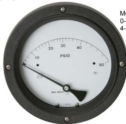
Model 120 0-50 PSID 4-1/2" Dial