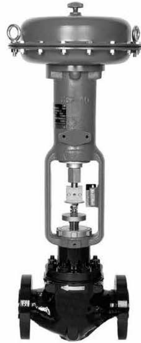
Mark ED/ET Series Valve