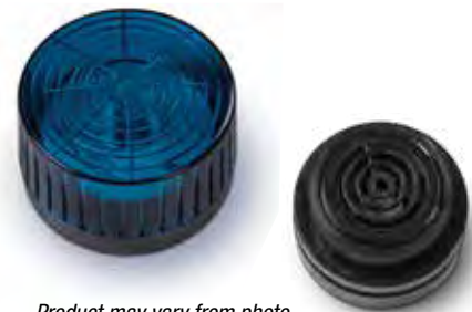
Product may vary from photo (reference photo only)