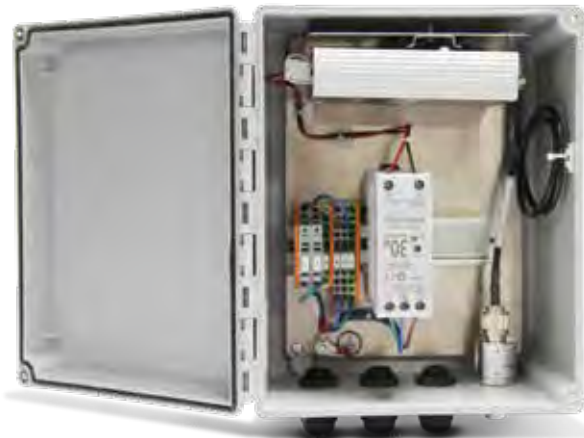
161954 Industrial Hot Spot