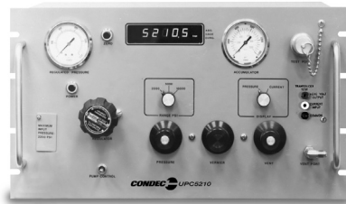
UPC5210 - 19 inch wide rack-mountable version of UPC5200