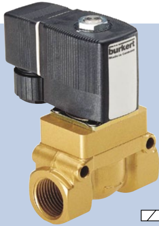
Shown with 2508 plug