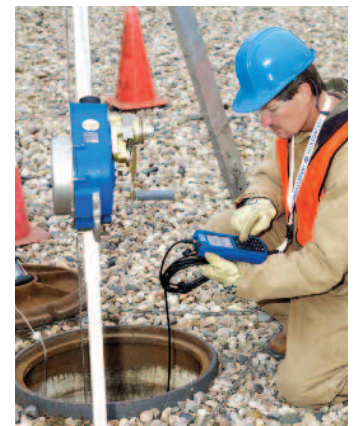
Quickly profile streams and rivers. Easily verify other metering tools or use to select optimal monitoring sites.