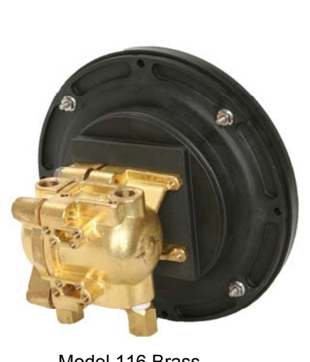
Model 116 Brass Cast Body

Model 116 can be equipped with one ore two independently adjustable SPDT snap acting Micro-Switches which can be set on decreasing or on increasing pressure. A switch adjustment screw and a switch lock screw is accessible after removal of the lens and bezel (removal of 4 screws). Interface to the snap acting micro-switch is via color coded 18 AWG flying leads and a ½ FNPT conduit connection. Model116 with switch temperature limits are rated at -20°C to +185°F