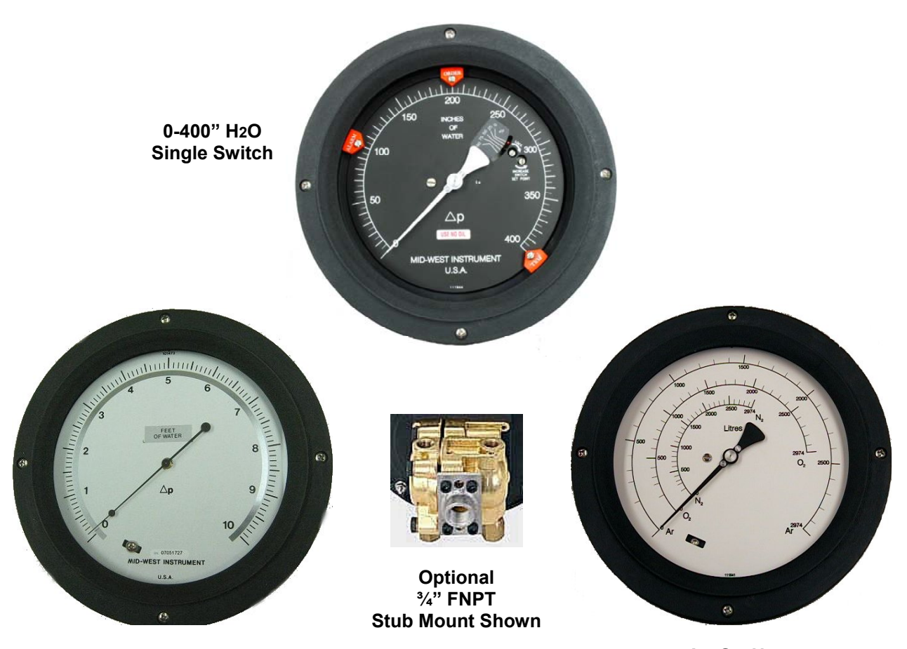
Model 105 0-10" H<sub>2</sub>O / Single Scale