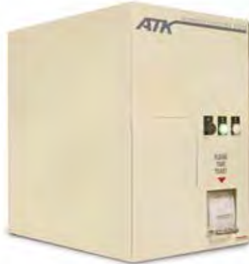
Basic printer kiosk PN 92971