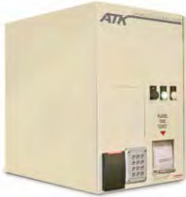
Basic printer kiosk with optional RFID card reader and optional number keypad