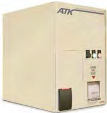
Basic printer kiosk with optional RFID card reader