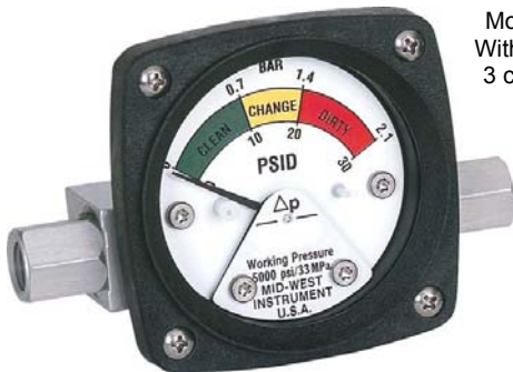
Model 122 With Special 3 color dial

A low cost differential pressure gauge for use in measuring the pressure drop across filters, strainers, separators, valves, pumps, chillers, etc., and for local flow indication and control.