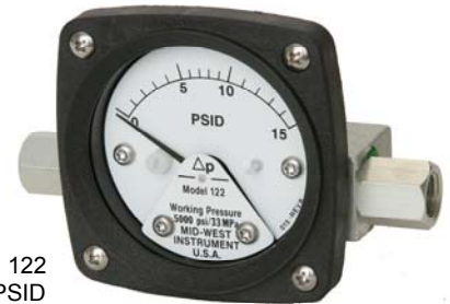
Model 122 0-15 PSID

An optional maximum indication follower pointer provides automatic indication of maximum differential occurring during a time period or system cycle. Reversed pressure ports are optionally available to facilitate installation and readability depending on which side of a filter, etc., the instrument must be installed.