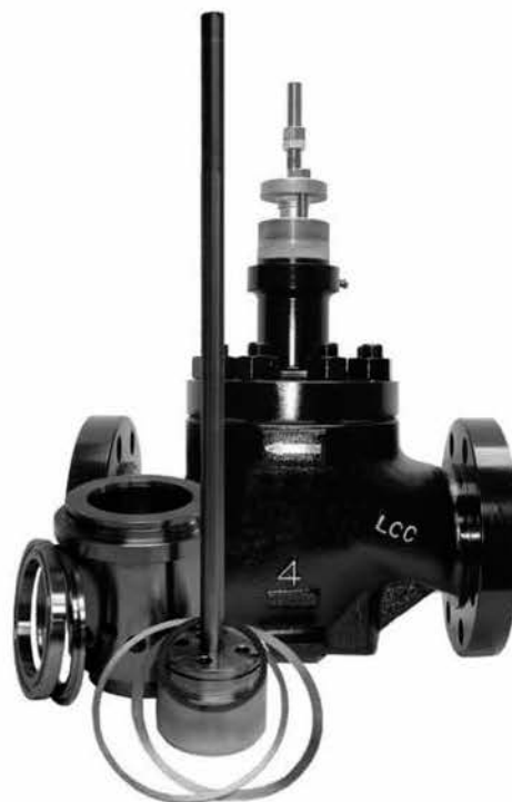
Typical Mark H Series Body with Trim and Seals