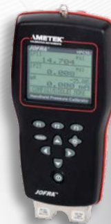
HPC500 HPC502 HPC600

When combined with these JOFRA calibrators, the APM is a powerful calibration tool.