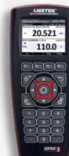
ASC300 ASC301 ASC321 ASC-400 ASC-400 BARO