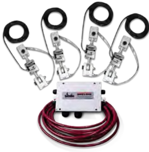
Available in configurations with three or four mounting assemblies. Picture is a representation of actual product

Stainless Steel Isolated Tension Cell Modules