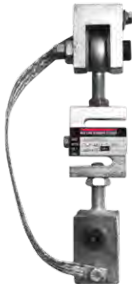
Module with RL20000 ST s-beam load cell.

The ITCM Series utilizes several Rice Lake Weighing Systems components to provide an unmatched level of performance in tank and hopper weighing applications and mechanical scale conversions. The ITCM SS incorporates clevis and unique rod-end ball joint assemblies to reduce the overall length to less than half of the traditional tension cell mounts, while providing correct load alignment. In addition, the load cell is completely electrically isolated from stray currents, which are a major cause of load cell failure. To complete the design, a grounding strap connects the two clevis assemblies to further provide safety to your load cells.