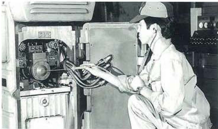
● Electric Motor