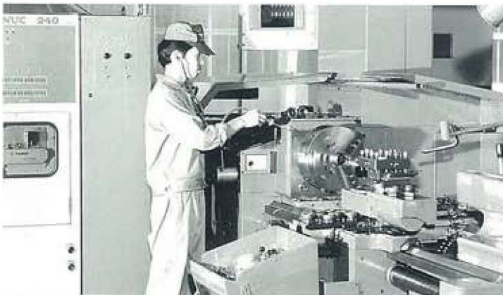
● Machine Tool Bearing