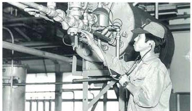
● Valve Leakage