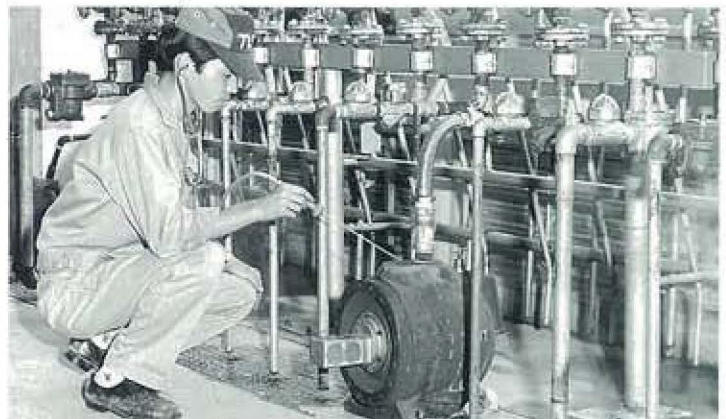
● Steam Equipment

Specifications are subject to change without notice.